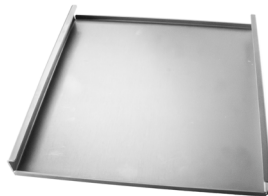
TEFLON COATED PLATE ALUMINIUM

INCREASE THE SPEED OF SERVICE WITHOUT THE NEED FOR OVEN GLOVES.