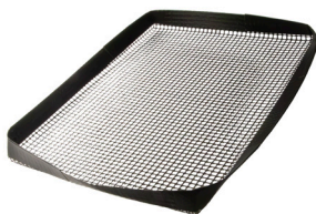
TEFLON MESH BASKET

USED FOR PIZZAS AND SUBS, FOR A CRISPY BASE. (REQUIRES PRE-HEATING)