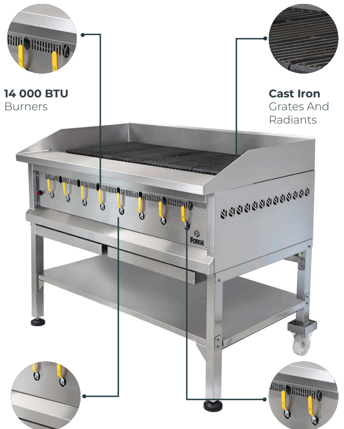
Solid Stainless Steel Construction